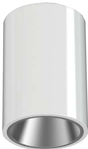
Mounting ring plus LED Module