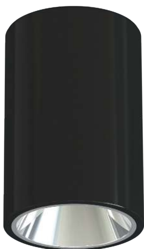
Mounting ring plus LED Module