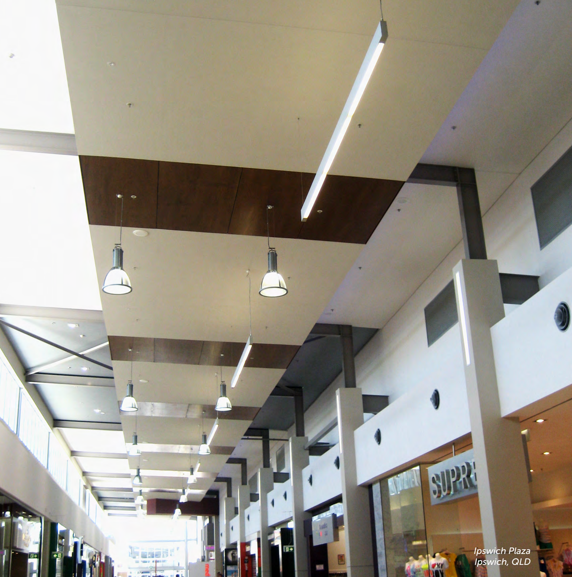
Ipswich Plaza Ipswich, QLD